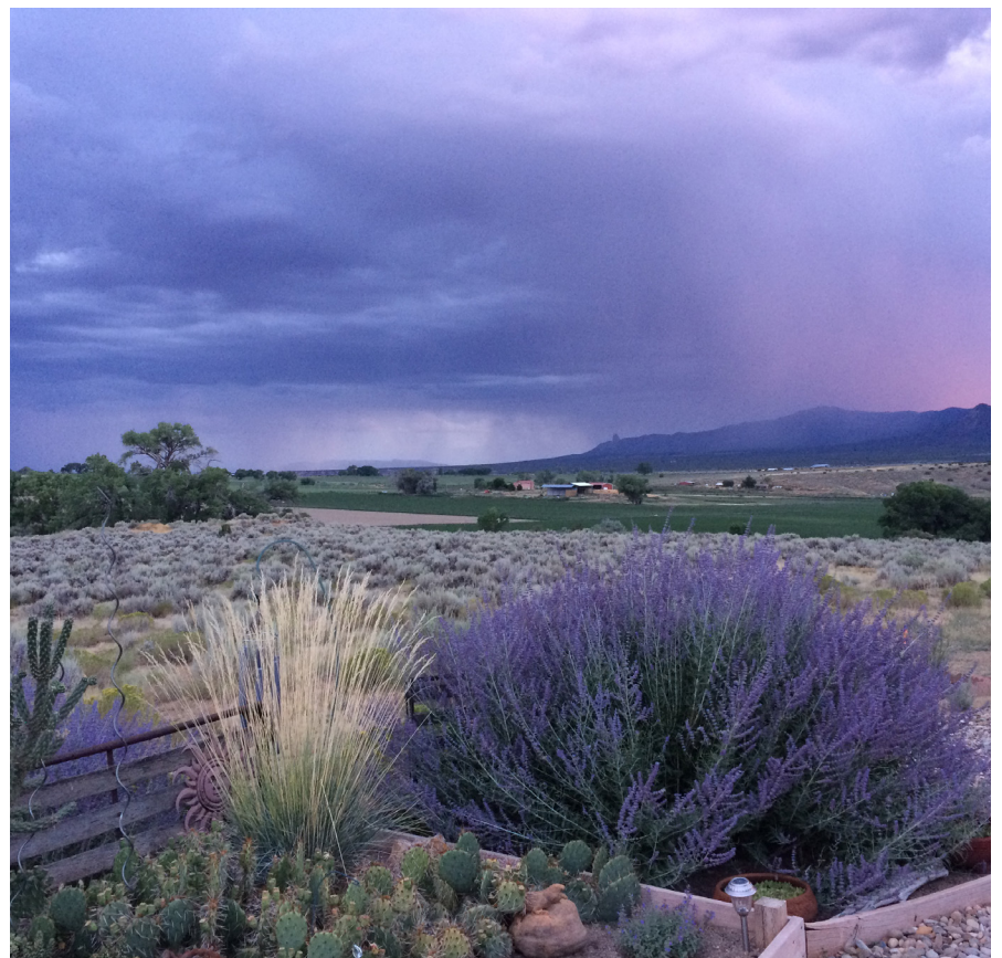
Co-op Photo Contest Winner August 2021 "Reflections of Lavender" by Cindy Lindvall

Start the generator before connecting appliances.