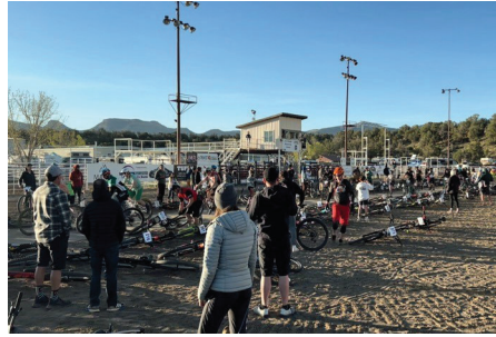
▲ EEA and Tri-State Generation and Transmission Association were two of several sponsors of the 12 Hours of Mesa Verde bicycle race held in May 2022 at Phil's World east of Cortez, CO. The race begins at the Montezuma County fairgrounds with a Le Mans start where racers run a short course to where their bicycles are waiting in the arena shown above. Racers must find their bike and mount up to begin the bicycle portion of the race. All proceeds of the race are donated to youth organizations in our community.

Capital credits are retired and paid to members each year as long as EEA