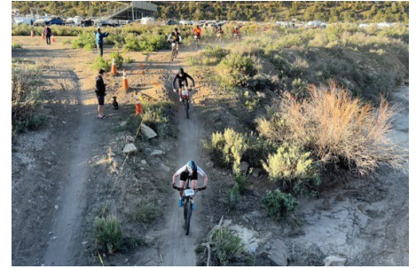
▲ 12 Hours of Mesa Verde racers entering the tunnel that goes under Highway 491 from the fairgrounds to the Phil's World race course.

remains in good financial standing as determined by our board. EEA targets an approximate 20-year retirement cycle, so members with allocated capital credits from 2002 and 2003 received over $1.6 million in 2022 capital credit retirements. Active members can choose to have their capital credit retirement paid as a bill credit or by check. Inactive members are paid by check.