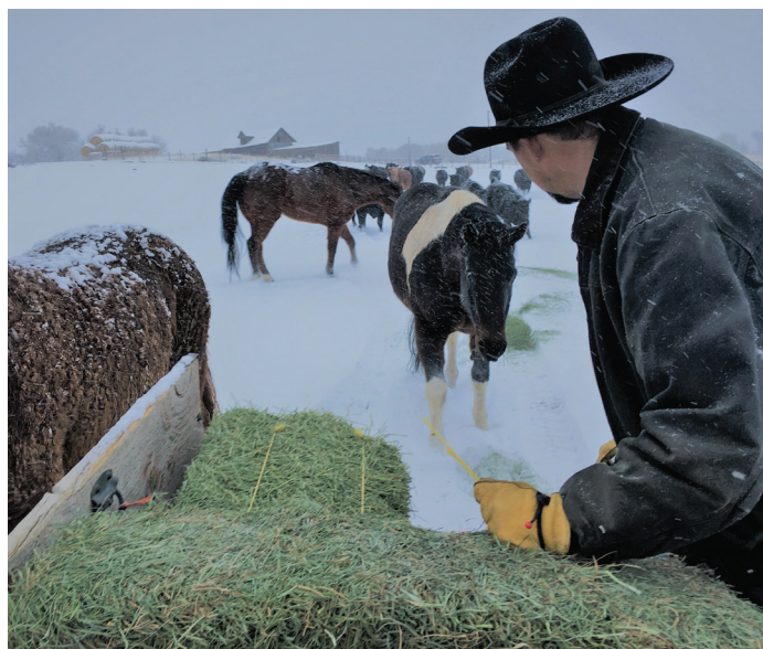
▲ Co-op Photo Contest Winner December 2022 – “Snow on the Ranch”

Concern for community is one of the seven cooperative principles that guide EEA as we work to serve our community. Thanks for your support of EEA as we continue to use our member-owned cooperative to make today a little easier for those in need and help grow a brighter future through education.