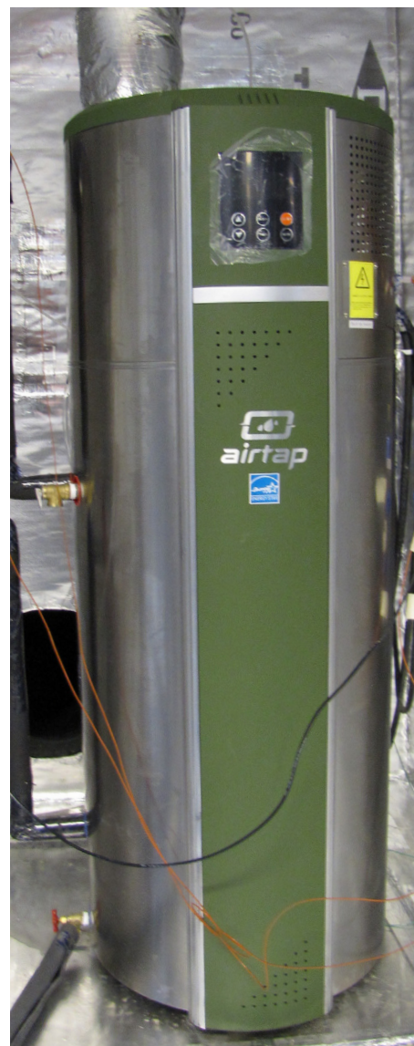
Heat Pump Water Heater technology has the potential to save twice as much energy when compared to an all-electric water heater because it utilizes the heat in the surrounding air instead of relying solely on electric resistance to heat the water.

If you are replacing a gas or solar water heater with a heat pump water heater you will need to consult with a qualified electrician to make sure you have power available at the water heater's location. You will also need to call EEA to ensure we have adequate capacity to serve this new electrical load. Taking the time to inspect your water heater now will save you the headache and expense of waiting until it fails. Replacing it with a much more efficient heat pump water heater when the time comes will help reduce your energy bill for years to come.